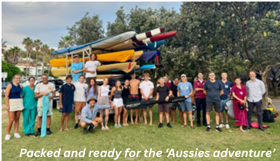
Packed and ready for the 'Aussies adventure'