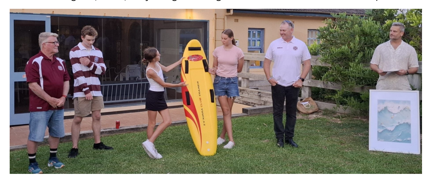
Thank you gift to the Club from our Graduating U14's