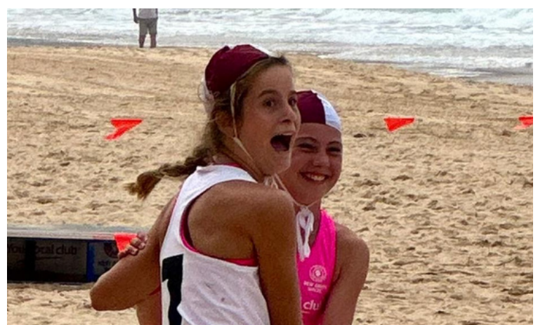
UNDER 14 GRADUATION