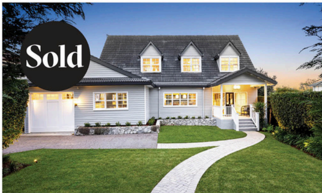
NTH BALGOWLAH $5,000,000+ 1 Tottenham Street 4 bed • 3 bath

With residential property sales right across Sydney's Northern Beaches and beyond, over a decade of hard-earned excellence and evidence speaks volumes.