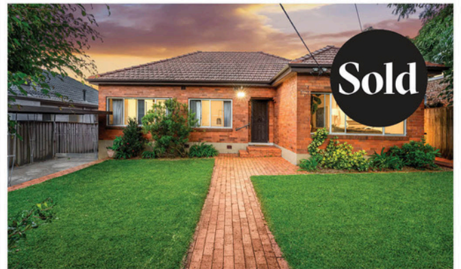
FRESHWATER $ Undisclosed 8 Waratah Street 3 bed • 2 bath