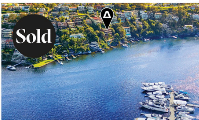
SEAFORTH $6,000,000+ 9A Seaforth Crescent 7 bed • 4 bath