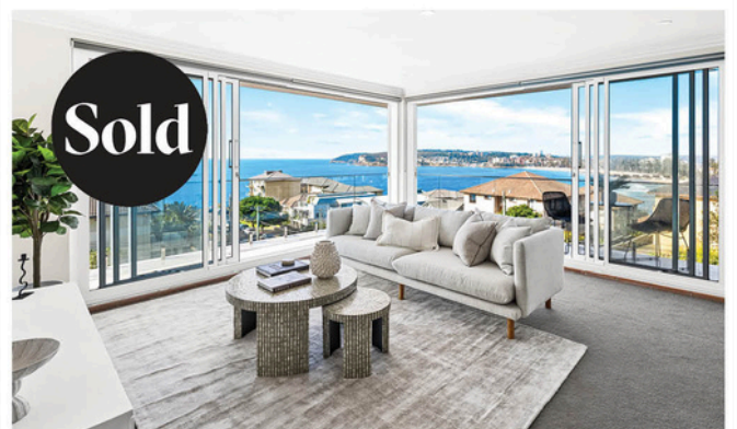
QUEENSLIFF $2,475,000 3/2A Pavilion Street 3 bed • 1 bath

Find yourself in a better place. Call us on 02 9971 9000